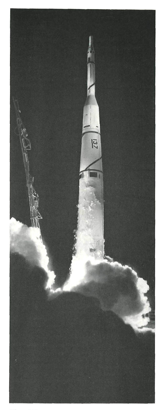
Thor-Able, first vehicle to be guided by Command Guidance System, blasts off from the Cape.

Although far removed from the metropolitan headquarters of Bell Telephone Laboratories, and even from the Western Electric Company manufacturing plants, the Cape Canaveral Branch Laboratory is performing an essential mission in support of the national military and scientific space exploration program.